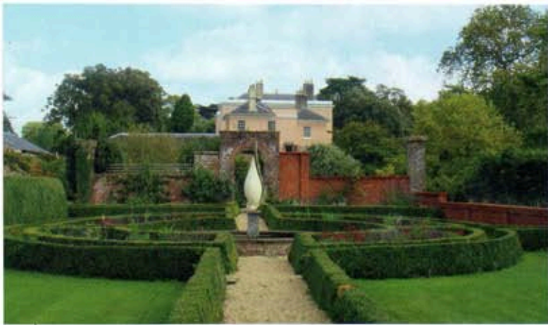
Above: Restored walls line the Harp Garden at Bignor Park, while curving box hedges encircle the new herbaceous planting

fan of Country House Rescue and it is riveting to see how Ruth Watson goes about turning around the houses she visits. But for us it is happening in an organic-symbiotic-holistic-integratedly-do-it-on-the-hoof kind of way. We have cut unnecessary costs and asked what would make people want to come here.